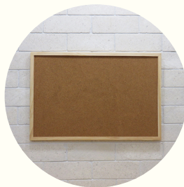
DIOCESAN BULLETIN ANNOUNCEMENTS