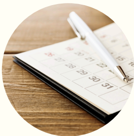
DIOCESAN LITURGICAL CALENDAR