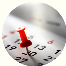
ANUNCIO DEL BOLETÍN DIOCESANO